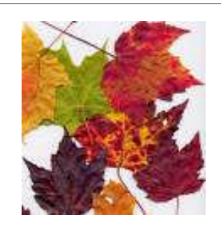
AUTUMN IS HERE