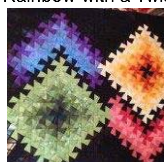
Rainbow with a Twist